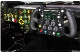
Audi R18 e-tron quattro dashboard

For anyone who missed it, the LeMans 24Hours event was held at the weekend. The overall winners were Andre Lotterer, Marcel Fassler and Benoit Treluyer, driving the hybrid powered Audi R18 e-tron quattro. An impressive achievement against a field of conventionally powered vehicles. Audi took the top three spots, with a diesel powered R18 in third place.